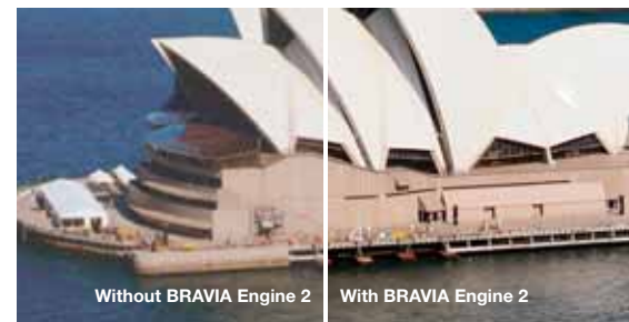
BRAVIA Engine 2 reduces noise levels and delivers clear images.