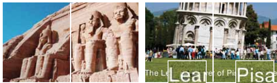
With MPEG Noise Reduction turned off, noise appears at high contrast edges and image doesn't appear clear.

MPEG Noise Reduction automatically reduces block noise and improves the edges of characters while at the same time, successfully suppressing noise that usually appears at high contrast edges. Enjoy crisp, noise-free images with sharp edges on BRAVIA's S-Series televisions.